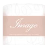
IMAGE TOILET TISSUE 700 SHEET

2 Ply (400 sheets) 11cm x 10cm sheet 48 Rolls per carton Australian Made and Owned Individually wrapped toilet rolls Large sheets with embossed edges