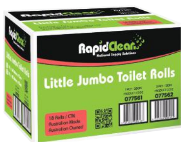
2Ply: 077562 1Ply: 077561

120 OR 360 METRE TOILET ROLLS &amp; DISPENSER