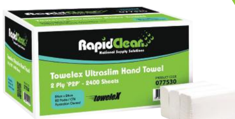
Paper Towel Code: 077530