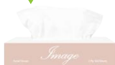
IMAGE FACIAL TISSUES

- 2 Ply (700 sheets) - 11cm x 10cm sheet - 48 Rolls per carton - Australian Made and Owned - Individually wrapped toilet rolls - Large sheets with embossed edges