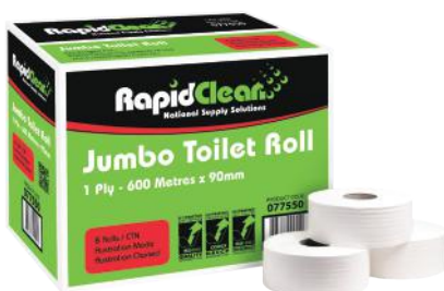
Toilet Roll Code: 077550