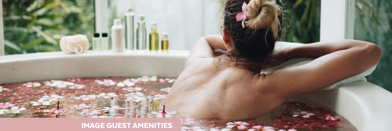
IMAGE GUEST AMENITIES