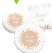
IMAGE SOAP PLEAT WRAP & SACHET