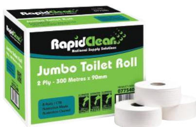
Toilet Roll Code: 077540

300 OR 600 METRE TOILET ROLLS &amp; DISPENSER