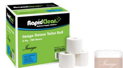
Toilet Roll Code: 077525