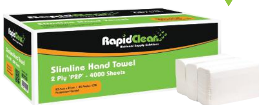
Paper Towel Code: 087535