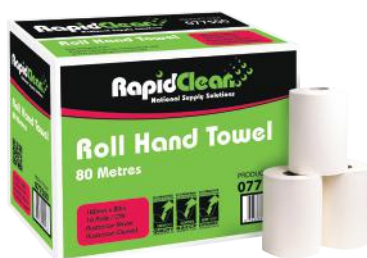
Paper Roll Code: 077500