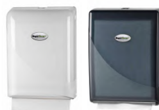
White: 033042 / Black: 033052