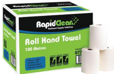
Paper Roll Code: 077510