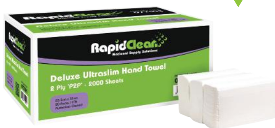
Paper Towel Code: 077095