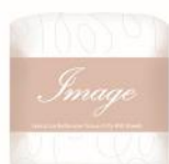
IMAGE TOILET TISSUE 400 SHEET