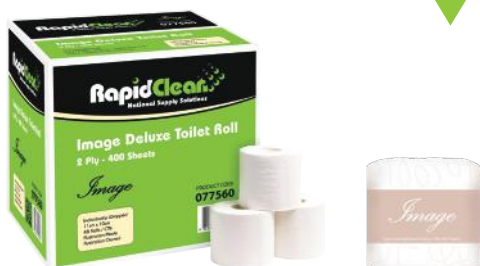
Toilet Roll Code: 077560

400 OR 700 SHEET TOILET ROLLS &amp; DISPENSER