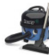
HVR200B - Blue