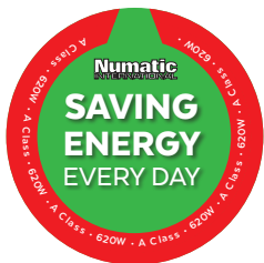
HVR200R - Red