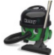
HVR200G - Green