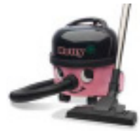
HVR200P - Hetty Pink