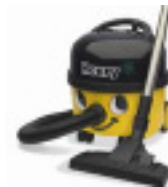
HVR200Y - Yellow